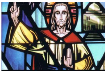
A Time to Turn Anglican Readings for Lent and Easter Week

L enten Wednesday Series On five Wednesday evenings in Lent, the parish is invited to come to the Church for Evensong, Supper & a Series of discussions on Anglican saints and what they said about the Season of Lent. The Anglican Way of being a Catholic Christian has produced some great saints! Come and learn about Thomas Cranmer, John Donne, George Herbert, Harriet Beecher