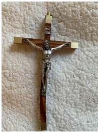
Crucifix from Shrine of Our Lady, Lourdes, France and blessed there by Abp. Morse in 1998. They are metal and wood, measuring 7” long by 3.75” wide.

These icons are exact copies, made by hand in traditional colors on gold sheets, canvas and wood.