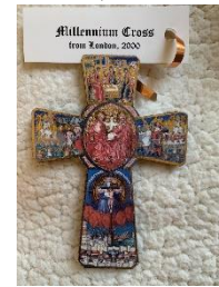
Millennium Cross from Westminster Cathedral, London blessed there by AbPp. Morse in 2000. 2 are 5” long by 3.25” wide. The third is 4” by 3” wide

These items have been blessed by Archbishop Morse, and so are priceless in value!