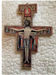
St. Francis San Damiano Cross Paper on wood, blessed in Assisi at the grave of St. Francis by Abp. Morse in 1993 6.5” long by 4” wide.