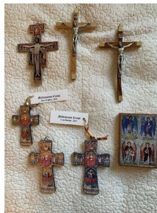
to show relative sizes