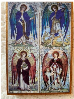
Pre-Raphaelite picture of four Archangels from a mosaic. 4.5” by 3”, blessed by Archbishop Morse In London in 2000.

These items have been blessed by Archbishop Morse, and so are priceless in value!