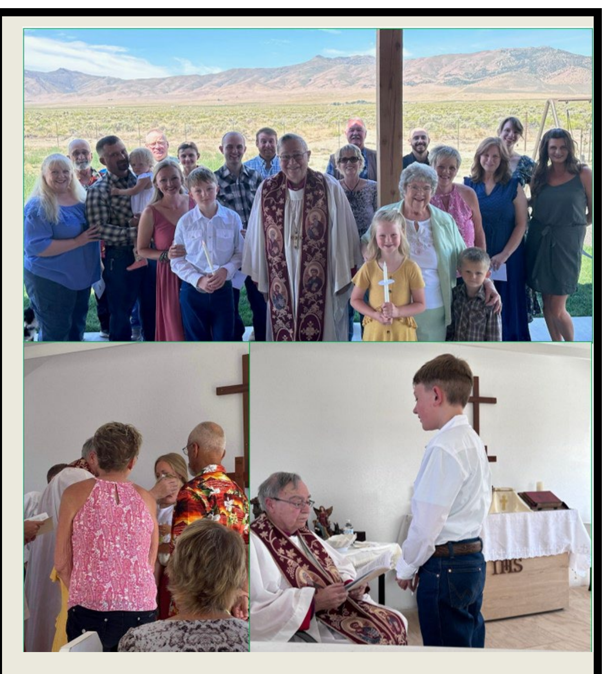
From Saint Luke's Redding A Picture that Warms the Heart: A Bishop serving as a Deacon